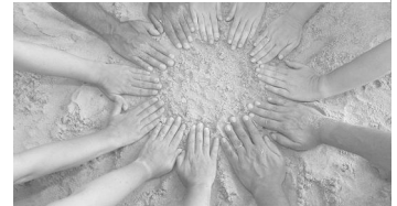
Take Part and Take Ownership!

After 3 failure to comply notices, the board turns them over to the attorney to institute legal action. Once the association wins the case, they can petition the court to enter the property and fix the problem. All costs would be covered initially by the association and legal action will